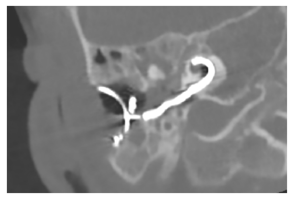
Figure 6: Coronal section of the right internal auditory meatus post repositioning of the electrode. The electrode is in place reaching the cochlear cavity.

The patient was taken back to surgery within 48 hours. The mispositioned cochlear implant was removed, and a new slim straight cochlear implant was re-implanted with great difficulty due to significant bleeding and perilymph/CSF fluid leak. Complete insertion could not be achieved; only 10 out of 24 channels could be inserted. The electrode position was confirmed by HRCT scanning