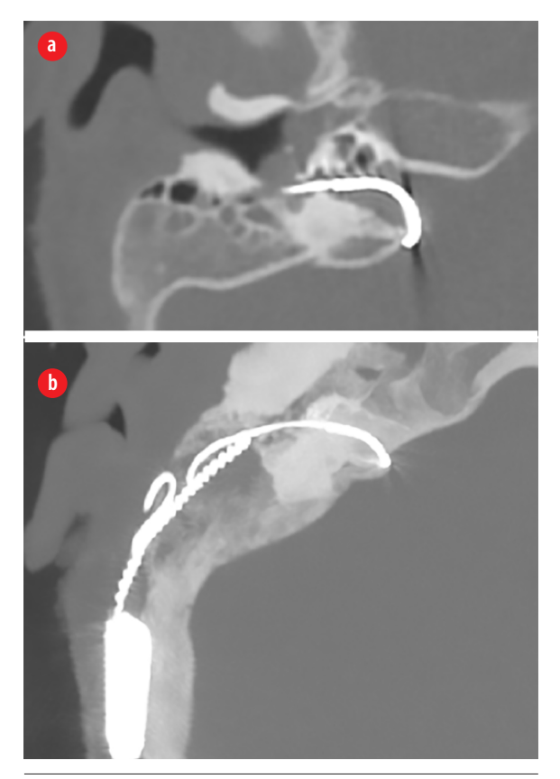
Figure 5: (a) Axial plane of internal auditory meatus (IAM) CT post-surgery showing the cochlear implant electrode passing through the IAM. (b) Maximum intensity projection reconstruction demonstrating the full course of the electrode from the subcutaneous device till the tip of the electrode reaching the intracranial fossa.

Postoperative audiological tests showed some positive results in hearing; impedance field telemetry was detected, neural response telemetry (NRT) was satisfactory, and speech recognition threshold was seen in two channels.