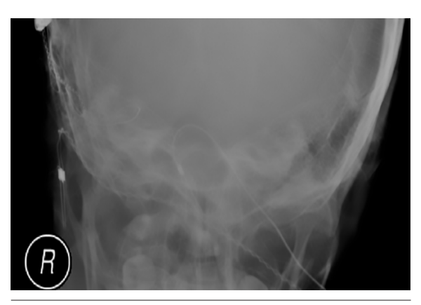
Figure 4: Postoperative X-ray demonstrating the misplaced cochlear implant electrode in the right internal auditory meatus.

During surgery [Figure 3], the expected perilymph/cerebrospinal fluid (CSF) gushing occurred on exposing the round window, which gradually stopped after five minutes. The electrode of the implant was inserted and then sealed with periosteum to prevent fluid leakage.